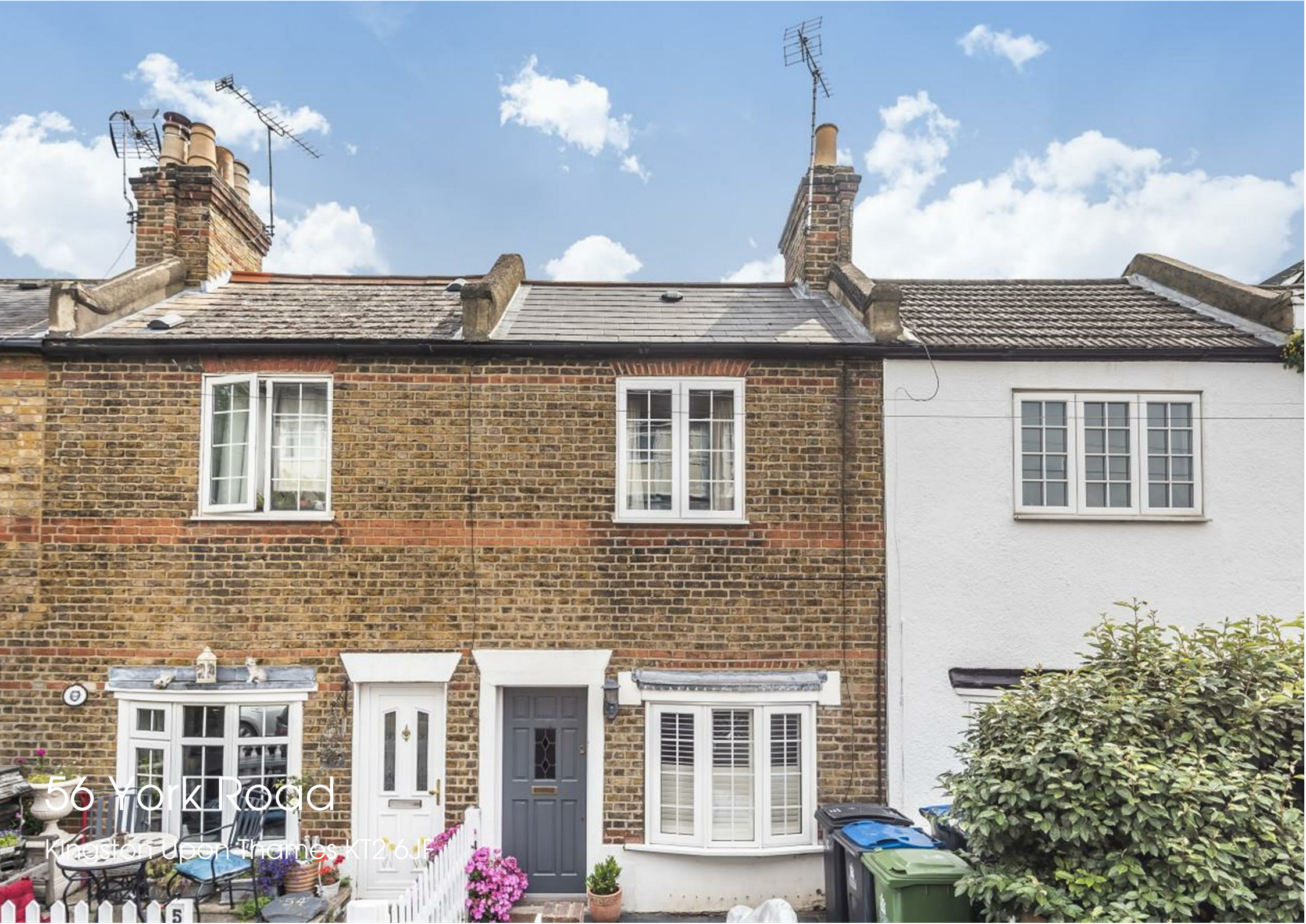
56 York Road Kingston upon Thames, KT2 6JF

34 Richmond Road Kingston upon Thames Surrey KT2 5ED www.gibsonlane.co.uk Tel: 020 8546 5444